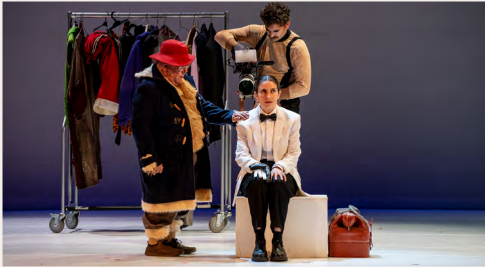
OH DEER!, APHIDS.